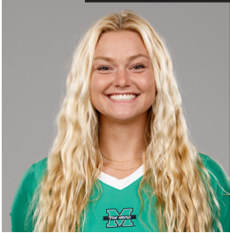
Preseason All-Conference USA