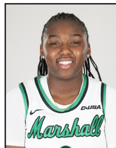
3 CC MAYS G - 5-8 - FR TAMPA, FLA.