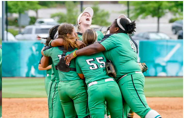
The Herd celebrating after defeating No. 1 seed North Texas to get back to the C-USA Championship game.