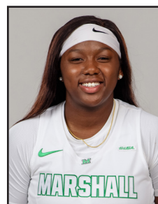
3 CC MAYS G - 5-8 - FR TAMPA, FLA.