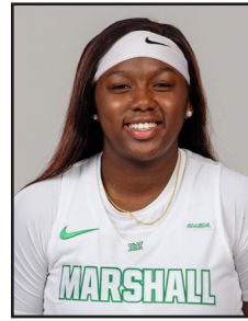
3 CC MAYS G - 5-8 - FR TAMPA, FLA.