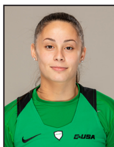
15 TANA DRIVER G - 5-0 - RS JR IRVING, TEXAS