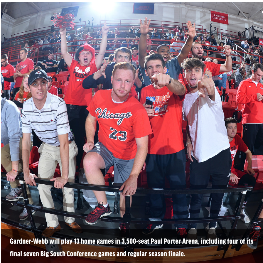
Gardner-Webb will play 13 home games in 3,500-seat Paul Porter Arena, including four of its final seven Big South Conference games and regular season finale.

HOME GAMES IN BOLD / ALL CAPS * Denotes Big South Conference Game