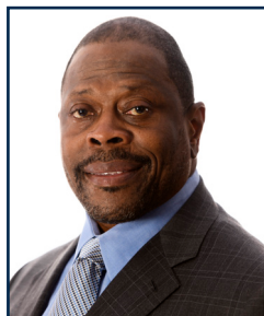
PATRICK EWING HEAD COACH