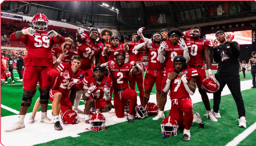
▲ Coyotes celebrate the NCAA FCS Playoff win over Tarleton State on December 7 that extended the home win-streak to seven-straight games, with 2024 ending with eight-straight home wins and an 8-0 record inside the DakotaDome.