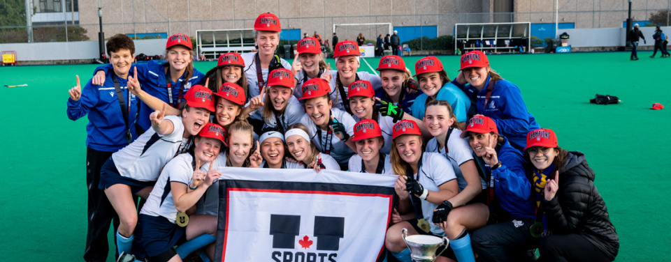
WOMEN'S FIELD HOCKEY U SPORTS NATIONAL CHAMPIONS & CANADA WEST CHAMPIONS