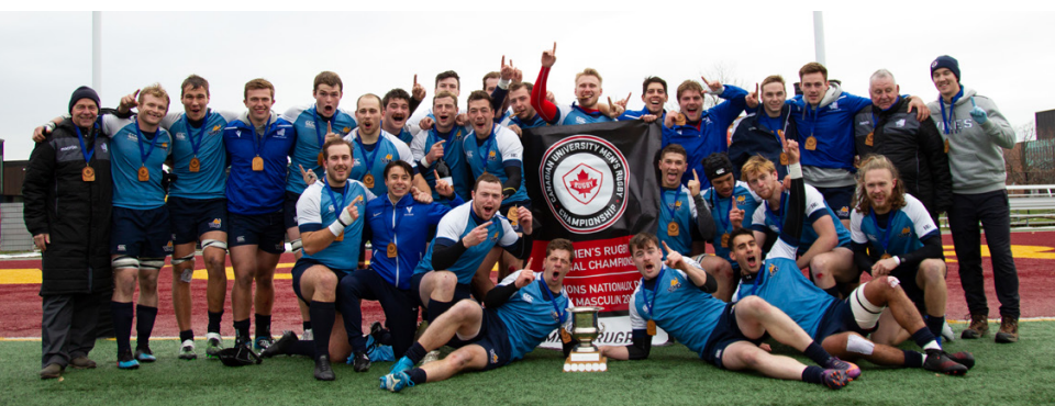
MEN'S RUGBY 15s CANADIAN UNIVERSITY NATIONAL CHAMPIONS