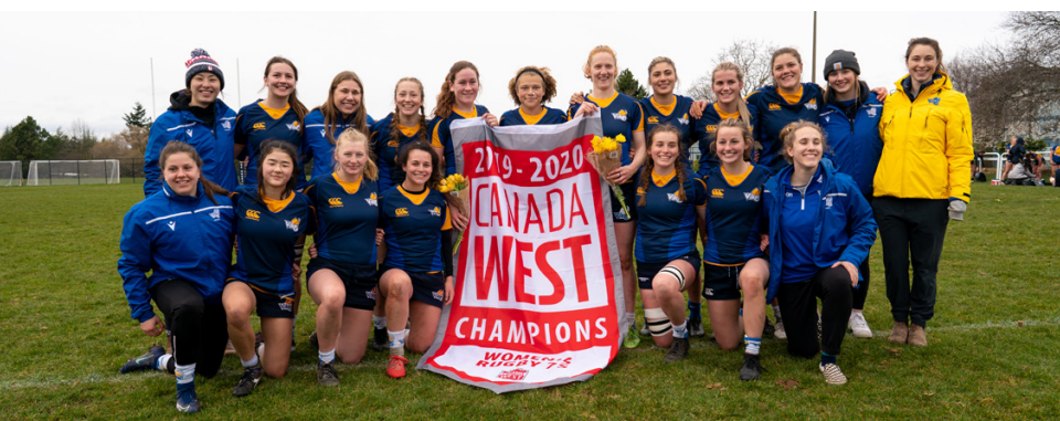
WOMEN'S RUGBY 7s CANADA WEST CHAMPIONS