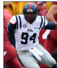
◀ WHITE TOP/ NAVY TRIM/ GRAY PANTS