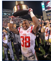
◀ WHITE TOP/ RED TRIM/ GRAY PANTS