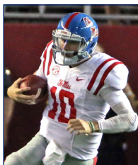
◀ POWDER BLUE HELMETS