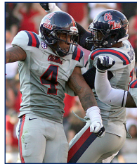
◀ GRAY TOP/ GRAY PANTS