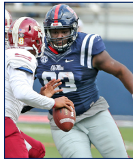
◀ NAVY TOP/ GRAY PANTS