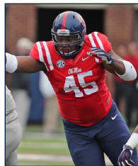
◀ RED TOP/ NAVY PANTS