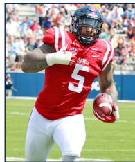
◀ RED TOP/ WHITE PANTS