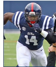
◀ NAVY TOP/ WHITE PANTS