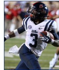
◀ WHITE TOP/ NAVY TRIM/ NAVY PANTS