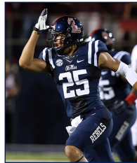
◀ NAVY TOP/ NAVY PANTS