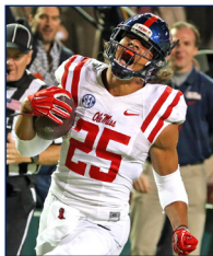
◀ WHITE TOP/ RED TRIM/ WHITE PANTS