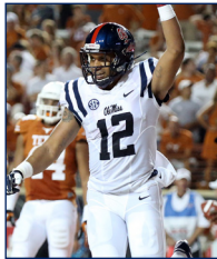
◀ WHITE TOP/ NAVY TRIM/ WHITE PANTS