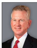
TOMMY TUBERVILLE Head Coach