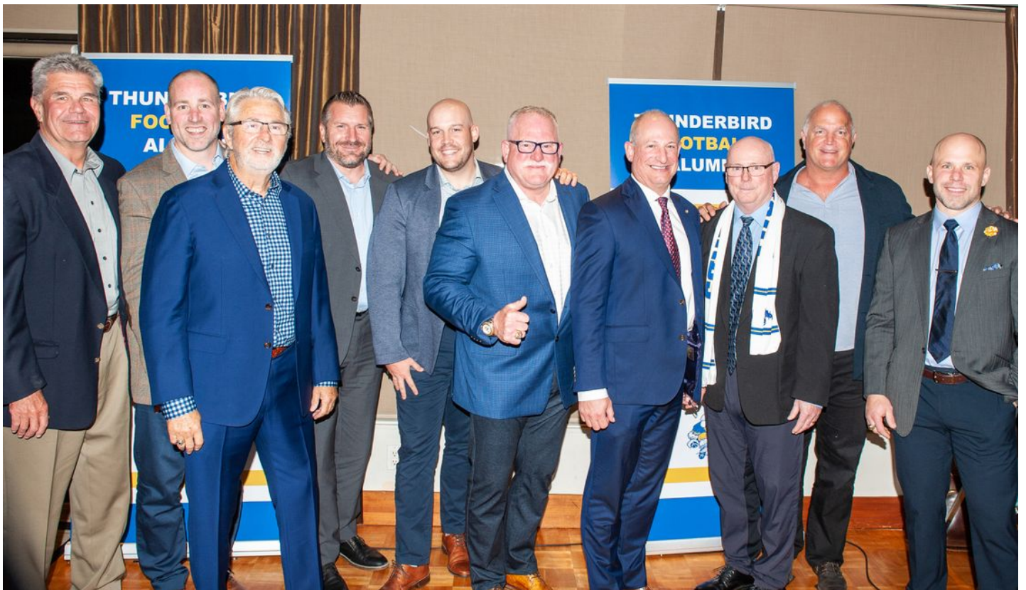
2020-2021's Wall of Honour Inductees at the TFA Legacy Dinner (Oct. '22).

2.) To raise funds to provide the necessary resources for the Football Program.