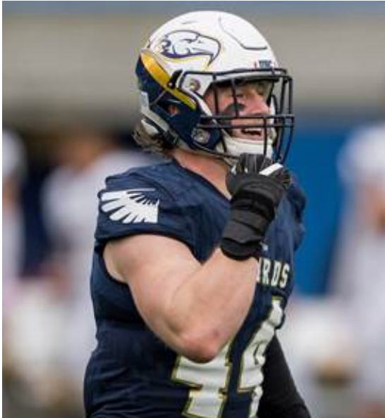
Lake Korte-Moore (44)