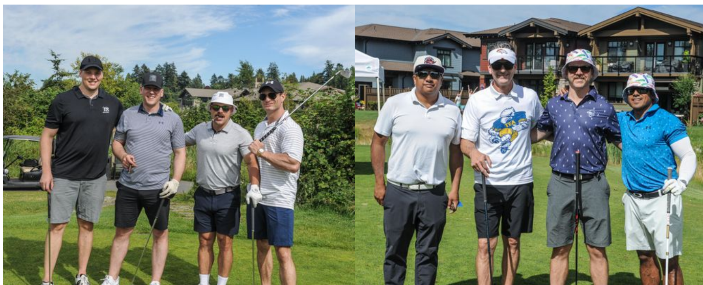
Alumni golfers at last year's Legacy Golf Classic, which raised $10,000 towards TFA Scholarships.

This team has the coaching, and it has the players. The last two seasons, the T-Birds have lost in the playoffs to teams that went on to the Vanier. We're close. With a unified Alumni base, UBC can dominate U SPORTS for years to come.