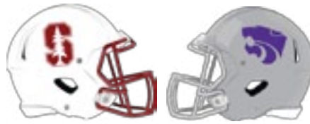
#8/7 Stanford Cardinal (0-0 • 0-0 Pac-12)