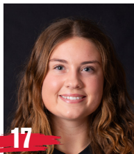
17 Summer Branch P / 5-6 / R-R / Fr. Holts Summit, Mo.