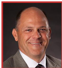
Head Coach 11th Year Missouri-St. Louis, 1993