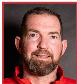
11th Year Fort Hays State, 1997