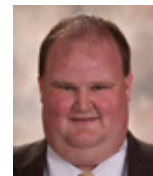
Ben Fox Sports Medicine