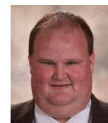
Ben Fox Sports Medicine