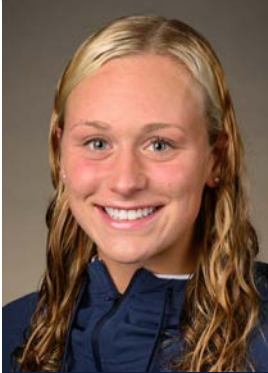
CAT STANFORD OCEANSIDE, N.Y. OCEANSIDE KINESIOLOGY