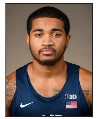
2021-22 AWARDS All-Tournament Team - Emerald Coast Classic