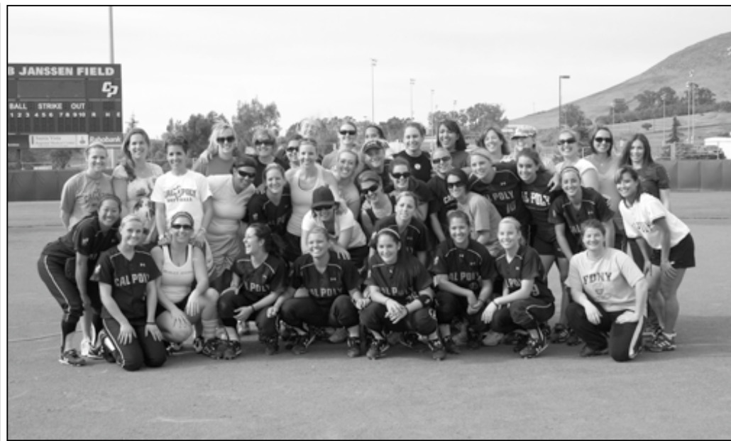
Cal Poly softball players and alumni celebrate the 2008 alumni game.