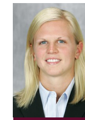
NATALIE DARWITZ ASSISTANT COACH