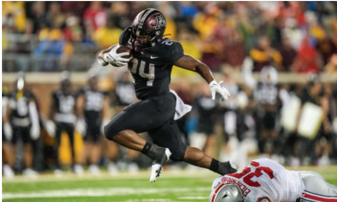
Box Score (Final) The Automated ScoreBook Ohio State vs Minnesota (Sep 02, 2021 at Minneapolis, Minneso)