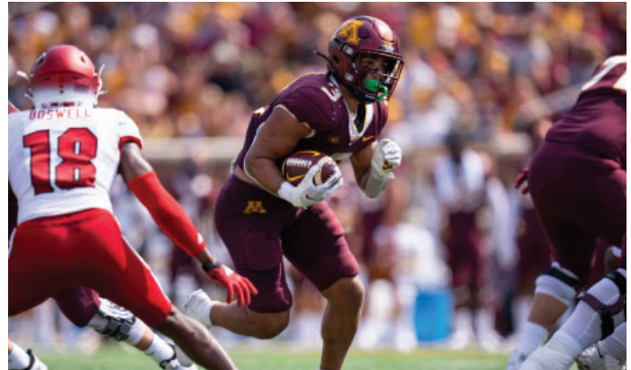
Box Score (Final) The Automated ScoreBook Miami (OH) vs Minnesota (Sep 11, 2021 at Minneapolis, Minneso)