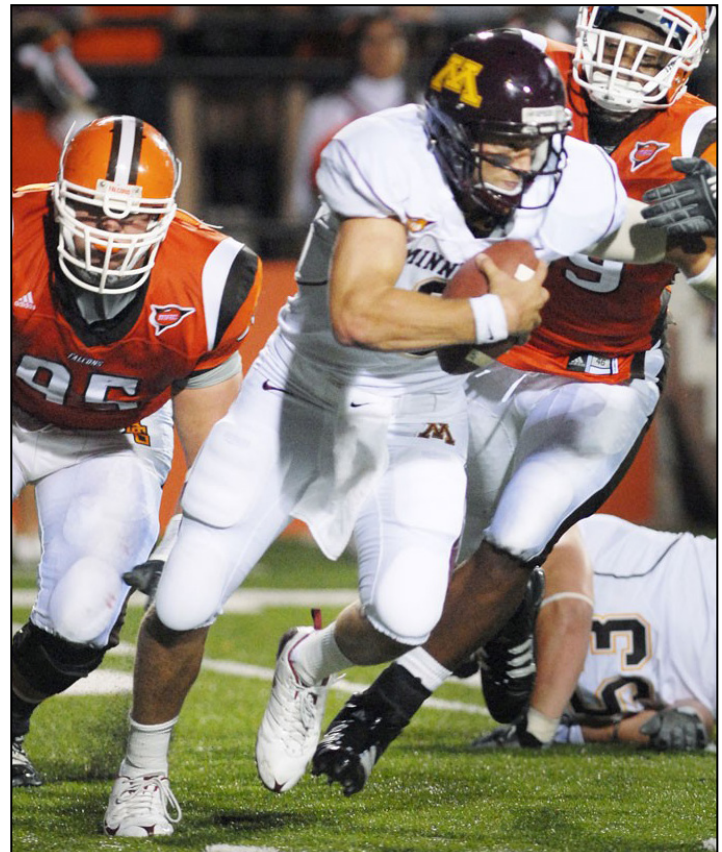
The last time Bowling Green and Minnesota met was in 2008 at Doyt Perry Stadium. The Gophers were the first Big Ten team to visit Doyt Perry Stadium.