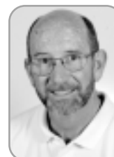
Wright Wayne Strength & Conditioning