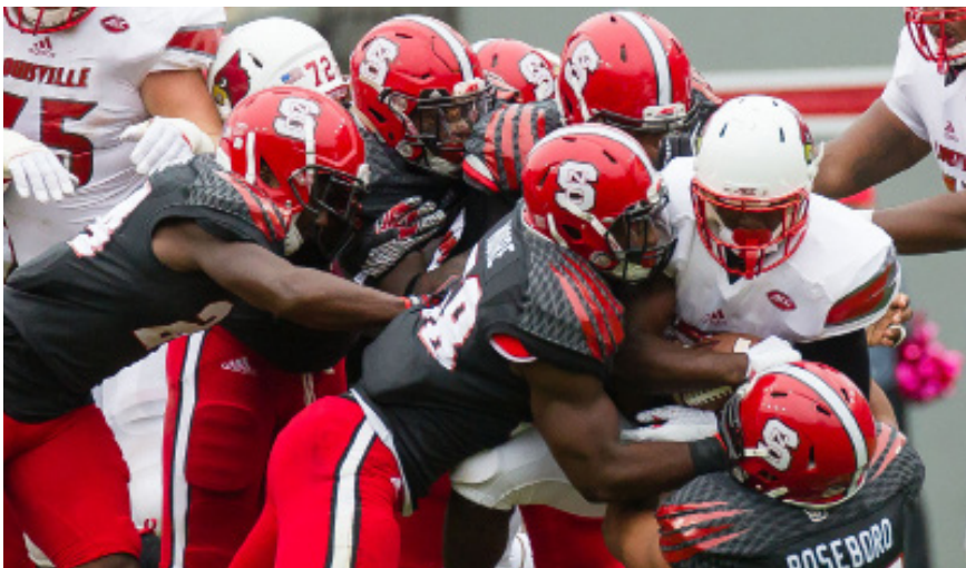
The Wolfpack defense held Louisville to 20 points on a soggy day in Raleigh.