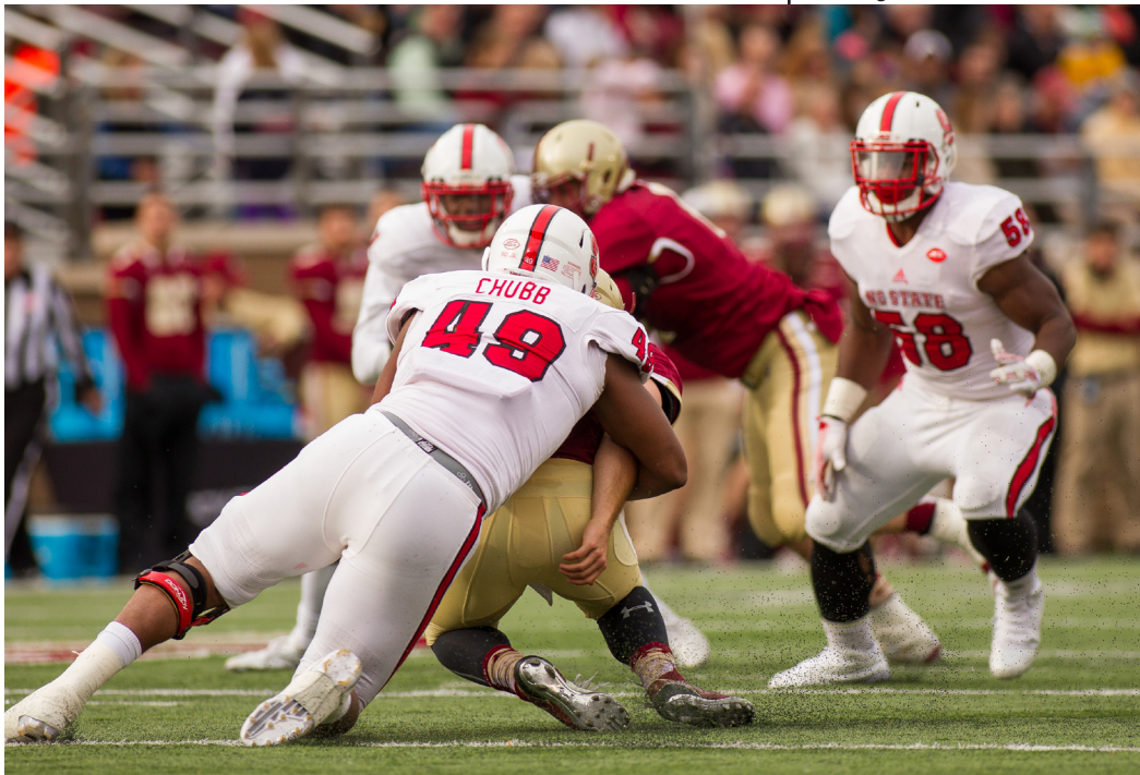
Bradley Chubb was named ACC Defensive Lineman of the Week after tallying nine tackles and five TFLs at Boston College.