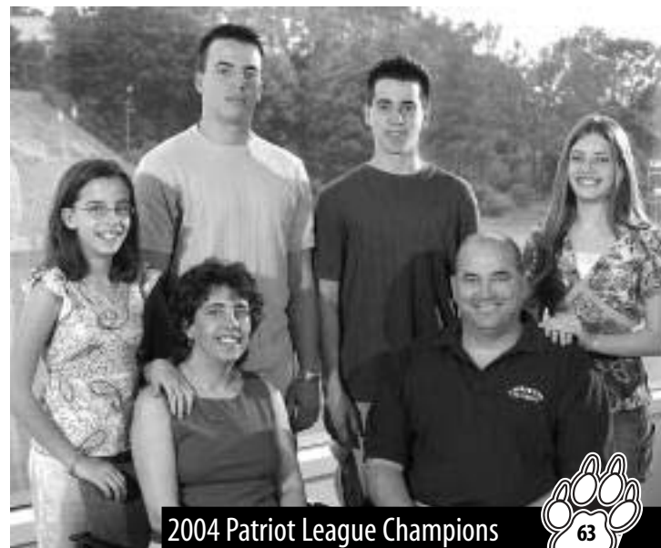
2004 Patriot League Champions