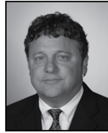
gregKAMPE Men's Basketball