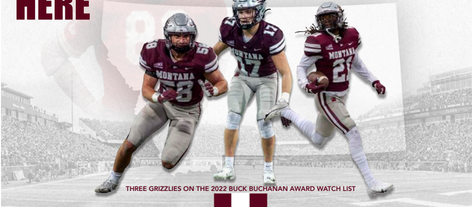
THREE GRIZZLIES ON THE 2022 BUCK BUCHANAN AWARD WATCH LIST