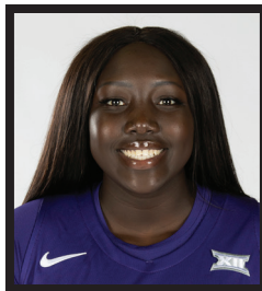
24 | ADHEL TAC FR | 5-11 | F Garland, Texas