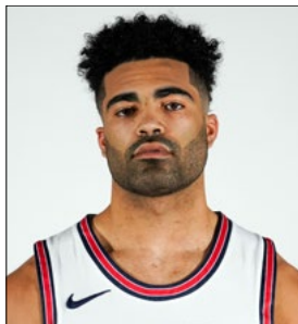
10 SINCERE CARRY Farrell, Pa.