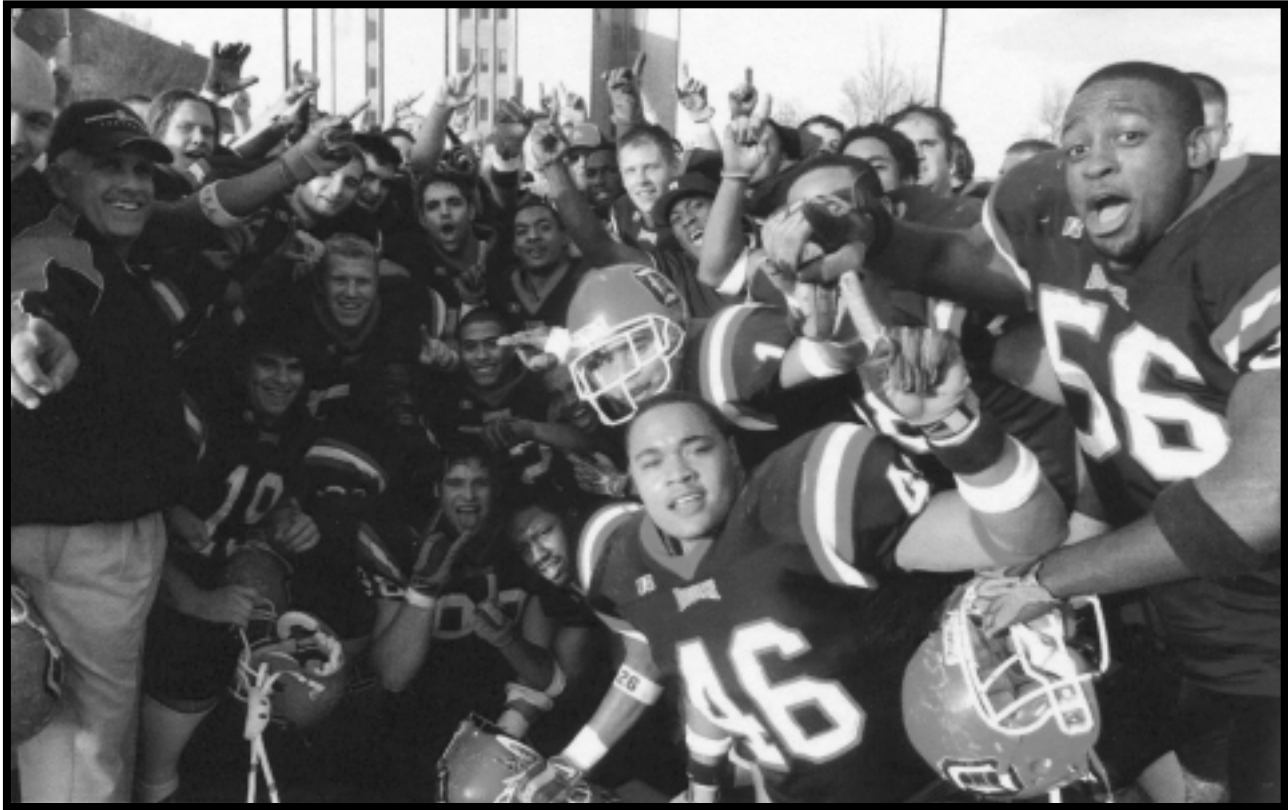
Duquesne won its final three games, including a 12-10 victory over Monmouth in the ECAC Classic, to clinch the 2003 Mid-Major National Championship.