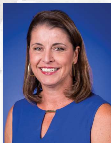
Joanne P. McCallie Head Coach 13th Season at Duke