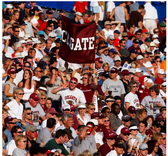
Colgate fans traveled en masse throughout the 2003 playoffs as the Raiders became the first and only Patriot League team to advance to the NCAA Championship Game.

* Games played in Hamilton, N.Y. # NCAA Championship Game (Chattanooga, Tenn.).