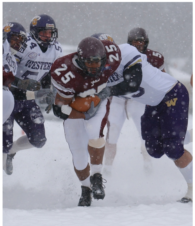
Colgate made it all the way to the 2003 NCAA Championship Game, thanks in part to this memorable 28-27 victory over Western Illinois in a driving snowstorm.