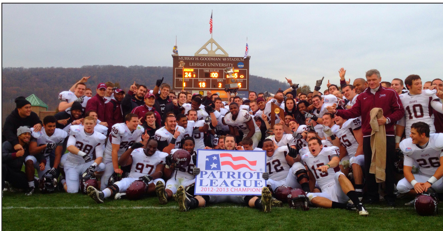
Colgate won its seventh Patriot League championship by rallying last year for a 35-24 victory at Lehigh. The Raiders trailed 24-14 at halftime before coming back and completing a perfect 5-0 Patriot League season.