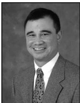
Al Jean Strength and Conditioning