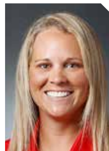
Whitney Young Women's Golf