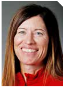
Holly Aprile Softball