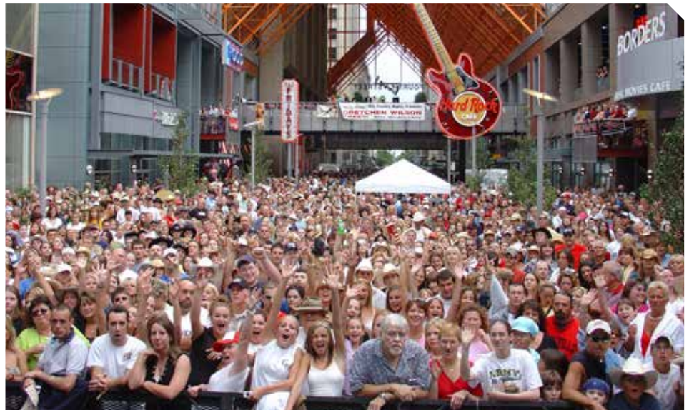
Cardinal fans participate in a rally at Fourth Street Live!, a downtown entertainment area.

Climate, location and a good transportation system helped convince United Parcel Service to establish its national hub in Louisville in the early 1980s. UPS, in turn, is attracting businesses that depend