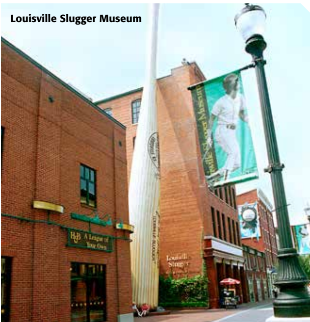
Louisville Slugger Museum