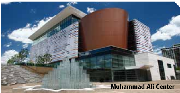
Muhammad Ali Center