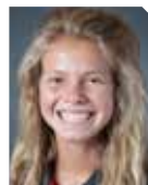
Bailey Beery Track & Field