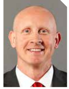
Chris Mack Men's Basketball