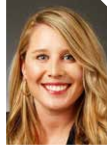
Dani Busboom Kelly Volleyball