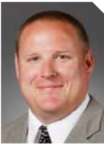
Dale Cowper Track & Field/Cross Country