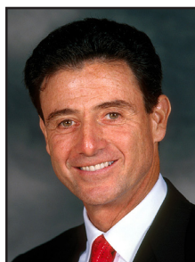
Rick Pitino Head Coach