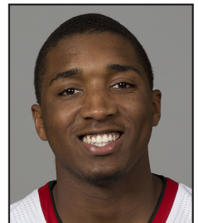
45 Donovan Mitchell G 6-3 210 Fr. Greenwich, Conn. (Brewster Academy)