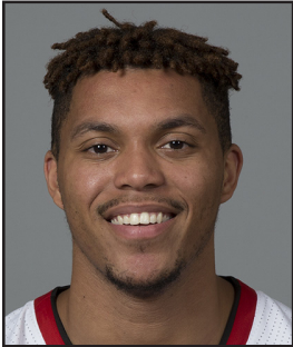
0 Damion Lee G 6-6 210 Sr./Gr. Baltimore, Md. (Drexel University)