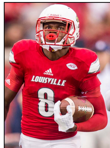
Quarterback Lamar Jackson leads the Cardinals with 314 yards rushing and 495 yards passing in four games.