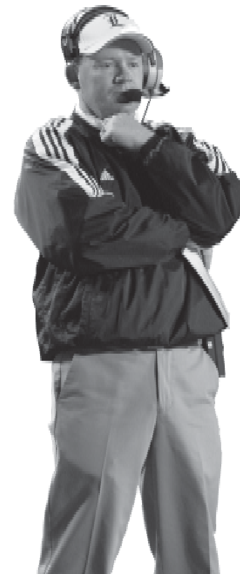
BOBBY PETRINO was an assistant coach for the Cardinals in 1998 before taking over as the Cardinals' head coach from 2003-06. He finished at Louisville with a 41-9 record.