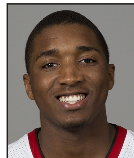
45 Donovan Mitchell G 6-3 210 Fr. Greenwich, Conn. (Brewster Academy)