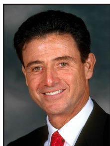
Rick Pitino Head Coach