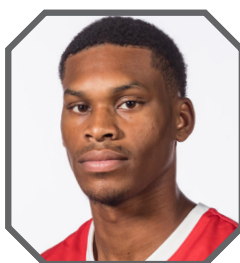
#0 • NEW WILLIAMS