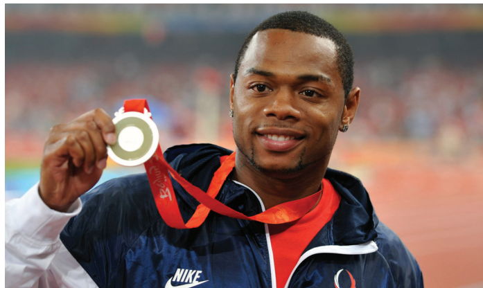
UC 60m record holder David Payne earning a silver medal in the 100m hurdles at the 2008 Olympics in Beijing.