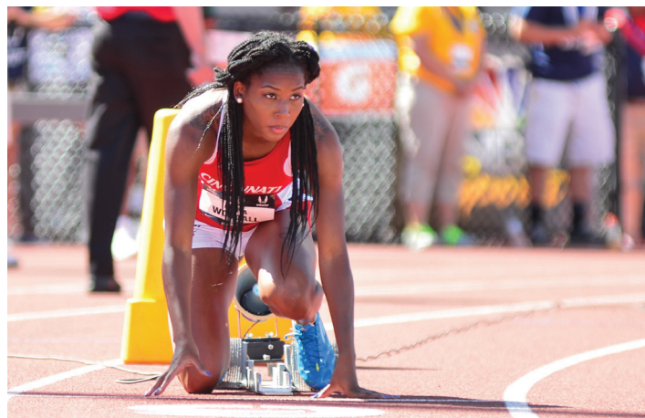
All-American and 400m record holder Kenya Woodall