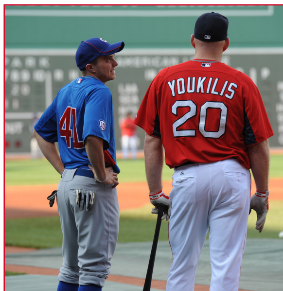
Tony Campana (left) and Kevin Youkilis at Fenway Park in 2011

Campana was a two-time letter winner for Cincinnati in 2007 and 2008. Campana owns UC records for career stolen bases (104), steals in a season (60 - 2007) and individual game (6). He was a 2008 All-BIG EAST First Team selection during his senior season. His nine career triples, eight of which he posted in '08, are tied for seventh on the all-time UC list. He was drafted by the Chicago Cubs in the 13th round (401st overall) of the 2008 MLB First-Year Player Draft and made his debut May 17, 2011 when the Cubs visited Great American Ball Park to play the Cincinnati Reds. In February 2013 he was traded to the Arizona Diamondbacks, and was again traded to the Los Angeles Angels in July of 2014. In November of 2014 he signed a free agent deal with the Chicago White Sox organization. Chicago Cubs (2011-2013), Arizona Diamondbacks (2013), Los Angeles Angels (2014), Chicago White Sox (2014).