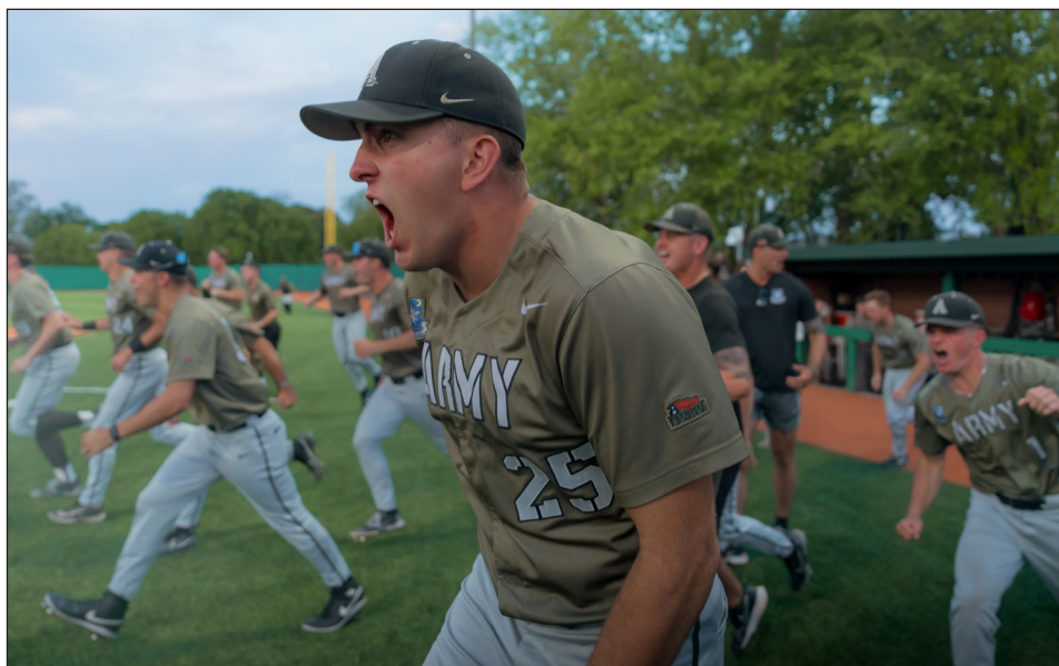
Army celebrates the final out of its Patriot League Semifinal Series win in 2025.