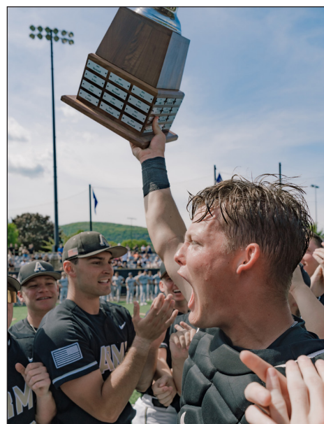
Army defeated Navy in the 2024 Patriot League Championship Series.