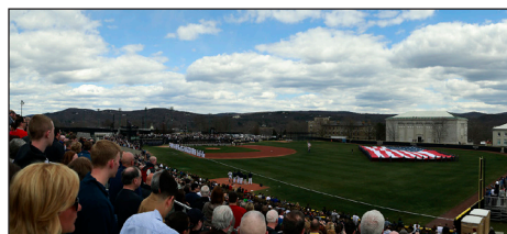
6,127 fans witnessed Army face the New York Yankees in '13 at Doubleday Field.