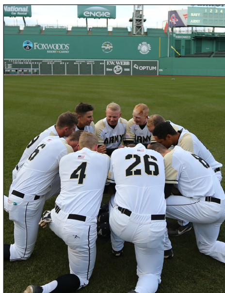
Army played Navy at Fenway Park in 2018.