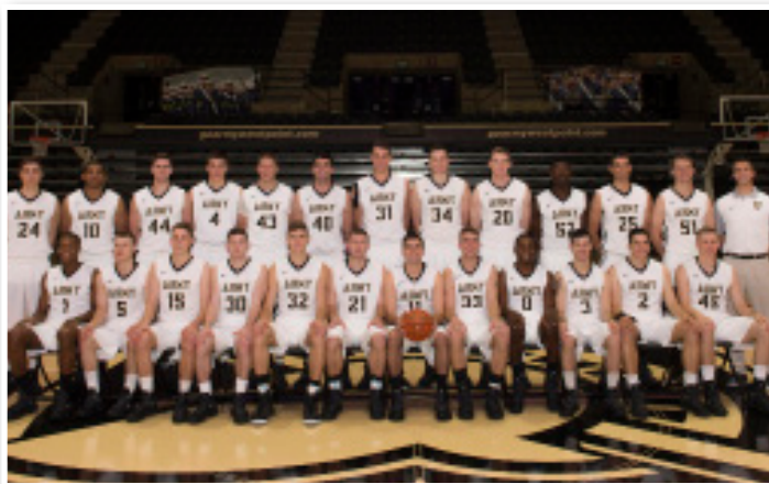
The 2015-16 team set school records for points, field-goals made, 3-point field goals made, and rebounds.