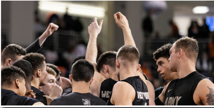
The Black Knights finished 2-1 over service-academy rivals Air Force and Navy during the 2019-20 season.