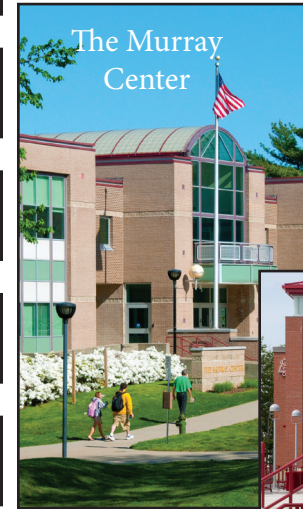
The Murray Center

Fill out the registration information and register today!