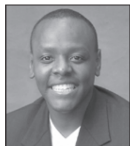
Ian Dube Track