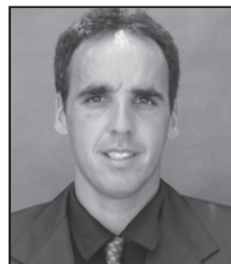
Gaucho Pinho Men's Soccer