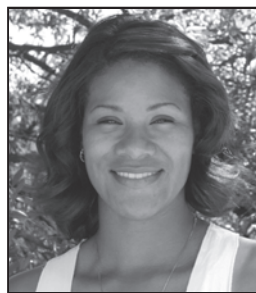
Heather Atkinson Track