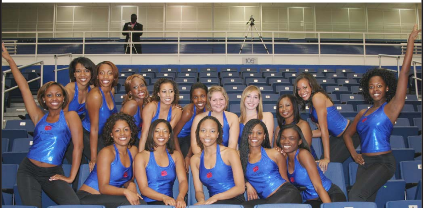
A new Dance Team was selected for the 2006-07 season.