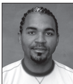
Eric Campbell Track