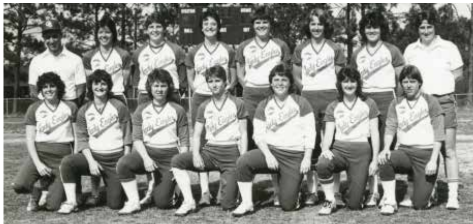
1984 Georgia Southern Slow Pitch Softball Team